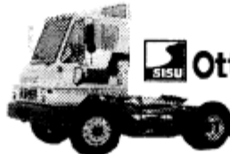
Ottawa Trailer Spotters YT30-YT50