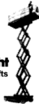
UpRight Scissor Lifts 15' - 50'

Call Today! Rent by the day, week or month! CALL: 409-840-4463 FAX: 409-840-6060