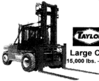
TAYLOR Large Capacity 15,000 lbs. - 52,000 lbs.