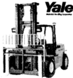
2,000 Lbs.-15,500 Lbs. Capacities

EQUIPMENT SALES-SERVICE-PARTS-RENTAL-LEASING